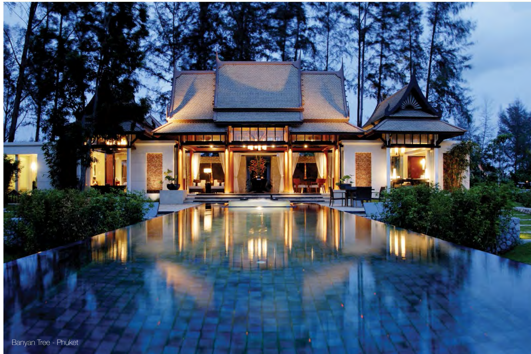
Banyan Tree - Phuket