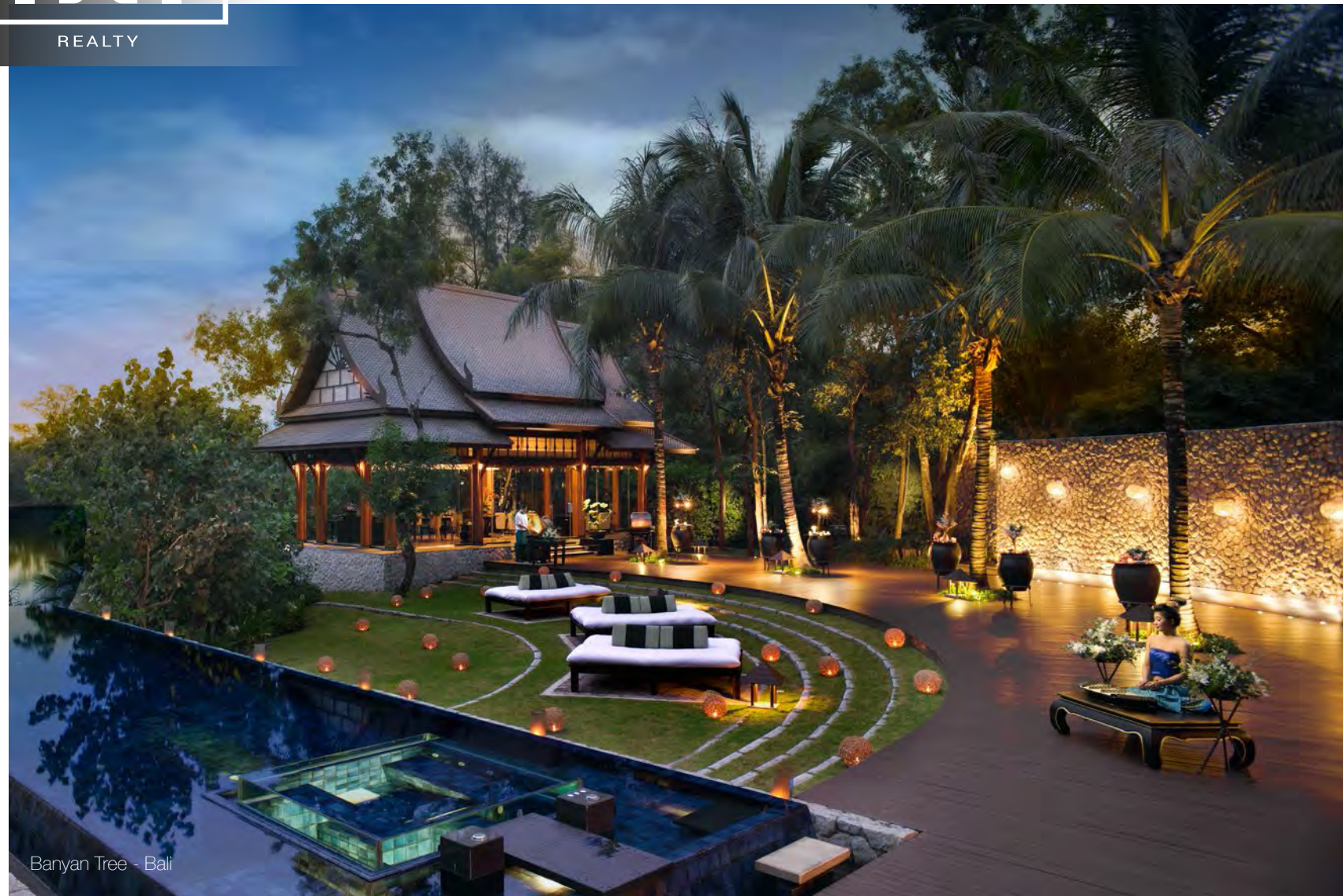
Banyan Tree - Bali